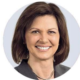
Ilse Aigner, MdL

Ambassador of the Republic of India Patron, German-Indian Business Forum