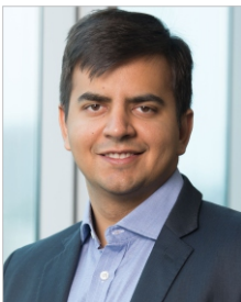
BHAVISH AGGARWAL Founder & CEO Ola Cabs, India